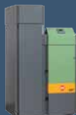
HDG Pellet Boilers

We will gladly provide you with the information.