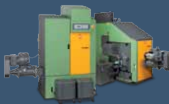
HDG Wood Chip Boilers