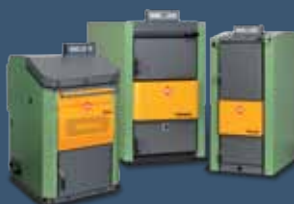
HDG Log Wood Boiler